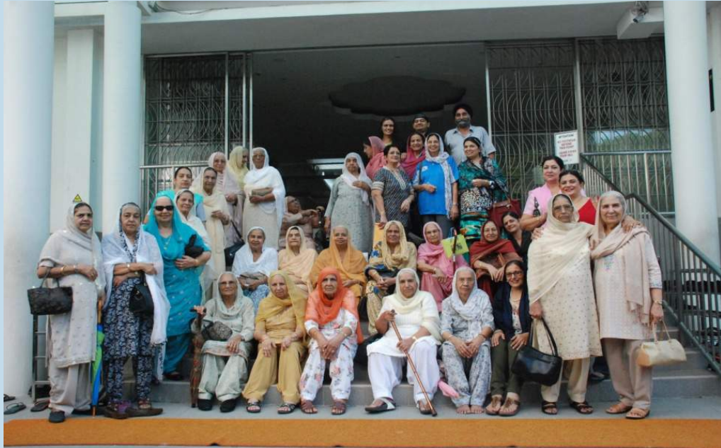
Sunheri Sahelian For Ladies above 70 Venue: Central Sikh Temple