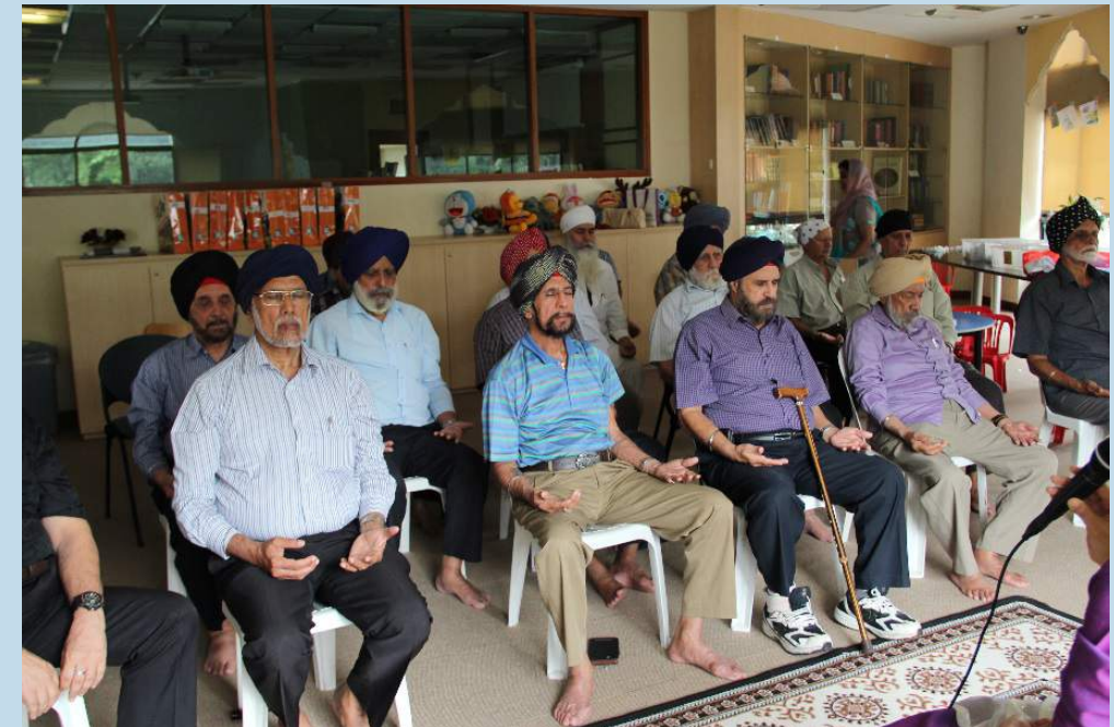
Sunehray Pal For Gents & Women Venue: Sikh Centre