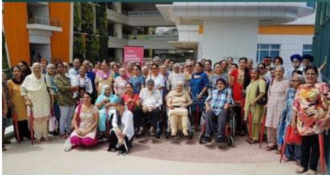
Outing: Silver Parade by SINDA