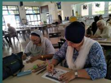
Spot the difference Activity