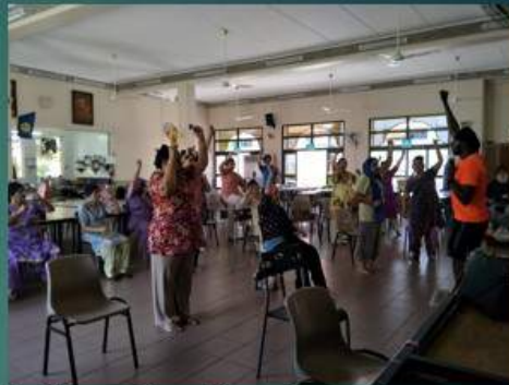
Exercise by Health Promotion Board