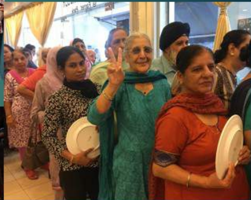
Outing: Kesari Movie & Hi Tea