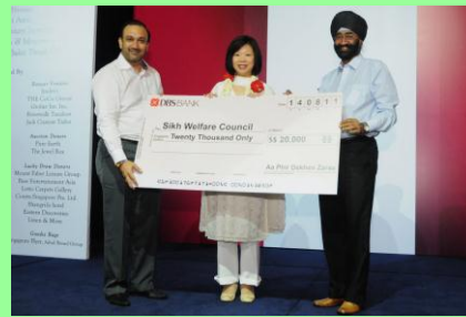
Ms Sim Ann holds a mock cheque for S$20,000(S$5000 more was raised)

Around 350 guests attended the show which included music, dance and a fashion and jewellery show by PureEarth and the Jewel Box – and donated wholeheartedly at an auction which followed. Member of Parliament from Holland- Bukit Timah GRC, Ms Sim Ann was the guest of honor at the event.